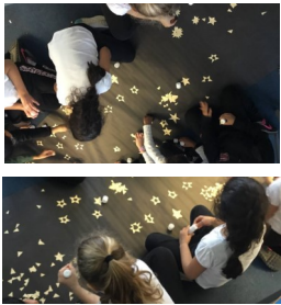
Our night sky inspired by "How the stars came to be"

Science week – 11–20 March. The focus this year is growth.